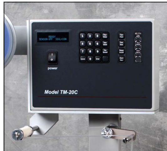
Optional Control Package

*Note: Includes 25 mm pocket depth capability